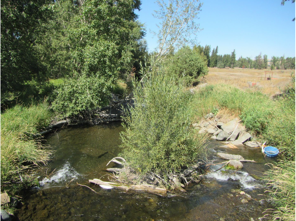
Photo taken looking downstream from Dorrance Lane Bridge at the diversion structure, with the irrigation intake, ditch, and drum fish screen located on the river right bank (September 2021).