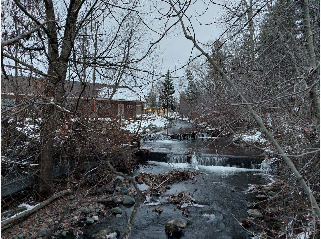
Photo taken looking upstream (south) from West Wallowa Avenue bridge at Wilson Diversion's downstream and upstream check dams structures (January 2023).