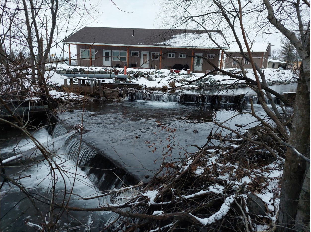
Photo taken looking upstream (east) from river left (Nez Perce Tribe's Am'sáaxpa property) at Wilson Diversion's downstream and upstream check dams and intake structure (January 2023).