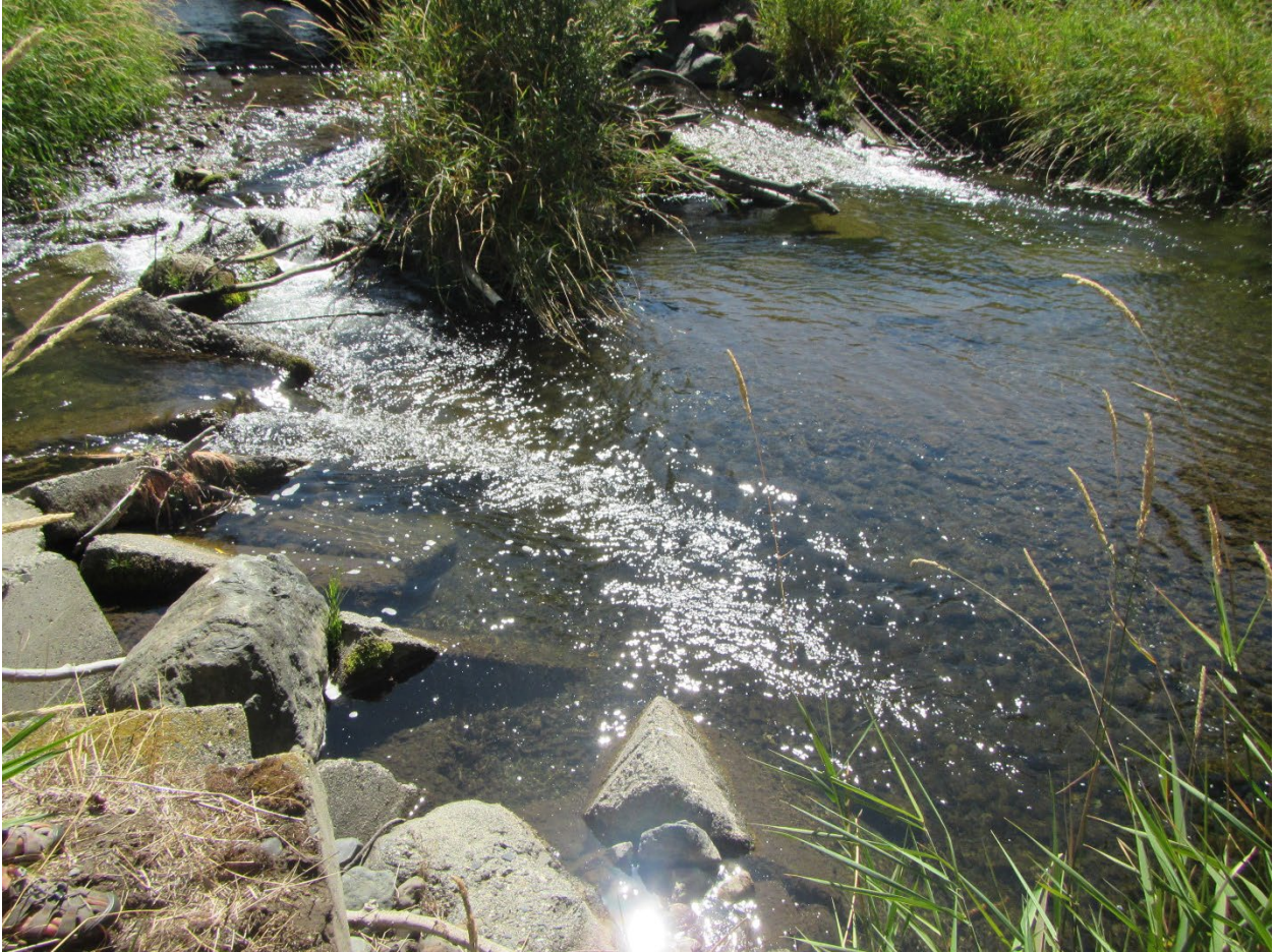
Photo taken from river right bank immediately downstream of the Dorrance irrigation intake, looking upstream at the diversion dam structure (September 2021).