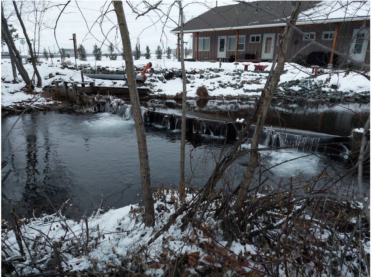
Photo taken looking upstream (east) from river left (Nez Perce Tribe's Am'sáaxpa property) at Wilson Diversion's upstream check dam and intake structure (January 2023).