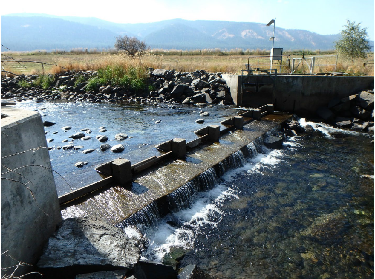
Figure 3. Photo taken from river right (east), downstream of Poley Allen Diversion, looking upstream with concrete abutment on left (east) and headgate structure on right (west).