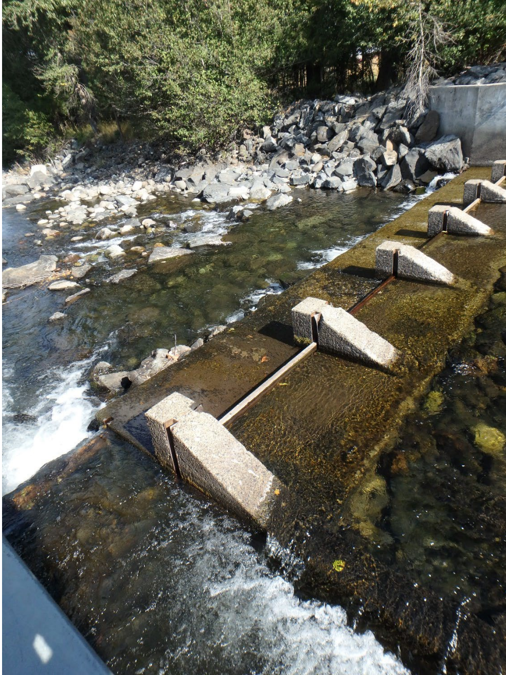
Figure 2. Photo taken from river left (west), upstream of Poley Allen Diversion, looking downstream (northeast) at concrete sill and low flow notch on river left (west).