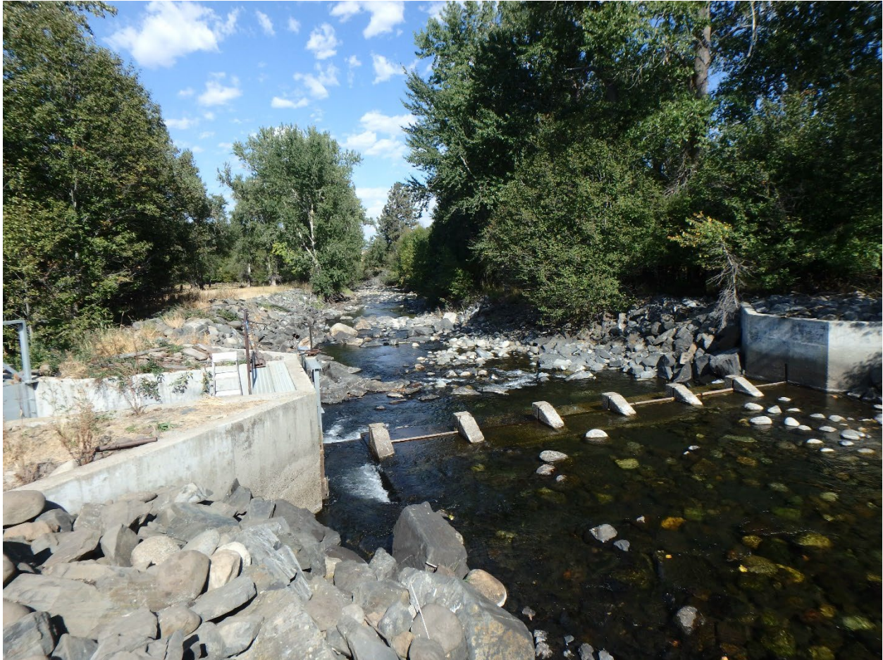
Figure 1. Photo taken from river left (west), upstream of Poley Allen Irrigation Diversion, looking downstream (north), with headgate structure located on river left (west) and concrete abutment on river right (east).