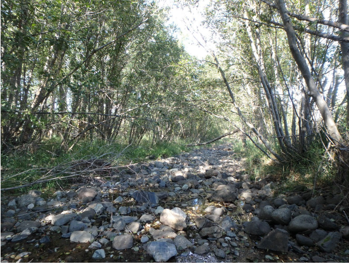
Figure 4. Photo taken in side channel, east of Poley Allen Diversion, looking downstream