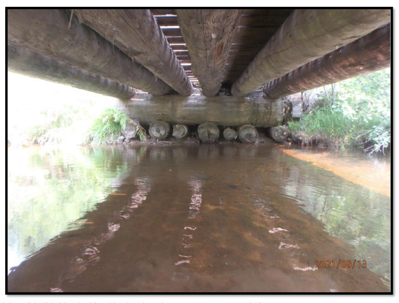
Musselshell bridge looking North at log abutments, supports, and girters.