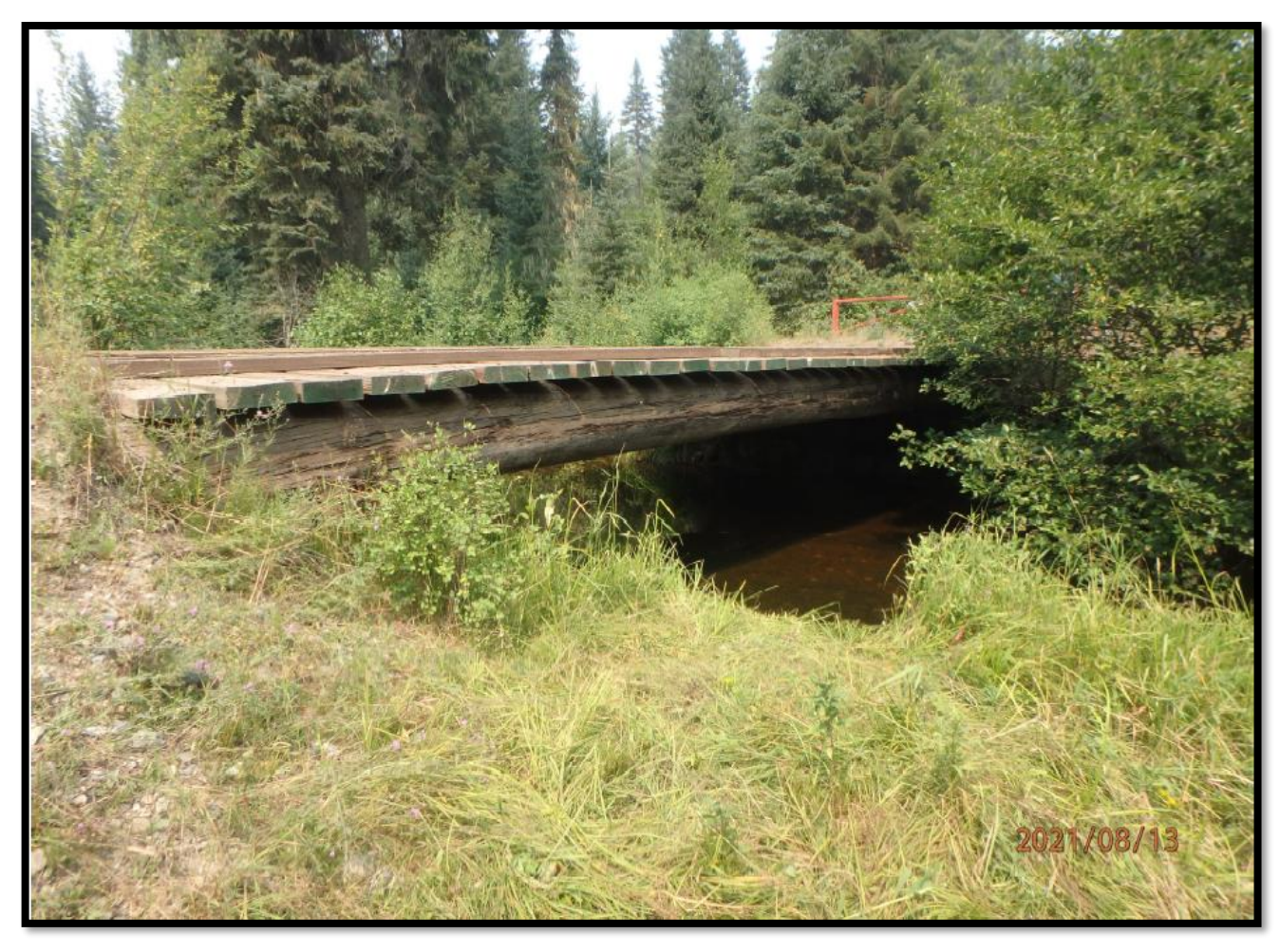
Musselshell Bridge looking Northwest at log girters and wood decking.