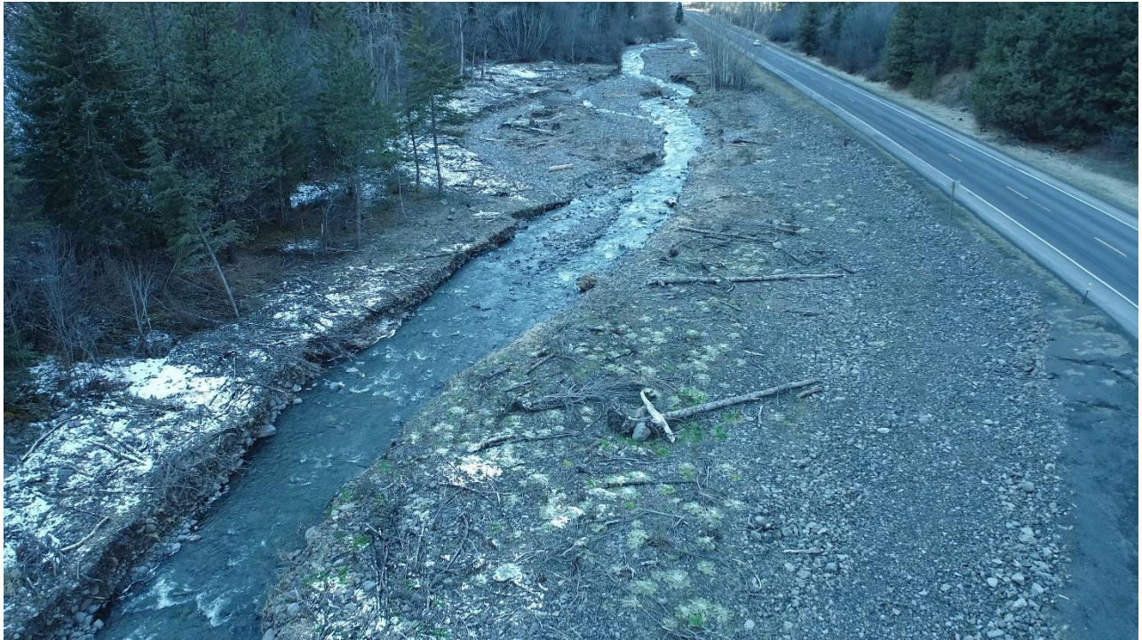
Photo 2. Overview of the project area photo taken February 19, 2020.