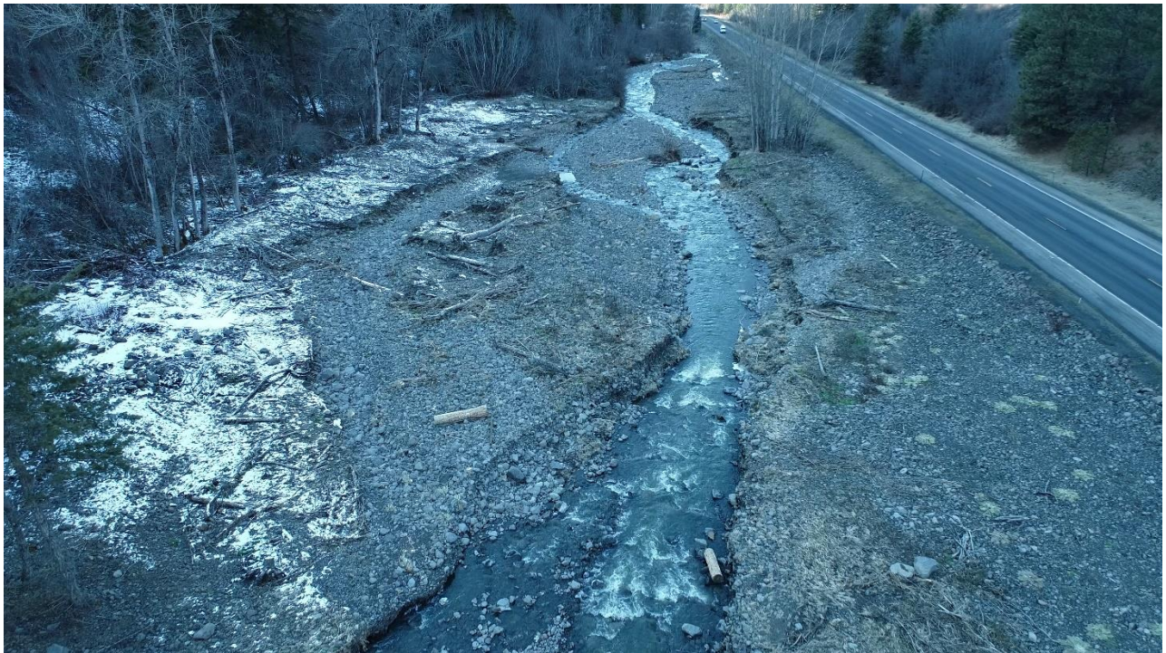
Photo 3. Lower reach of the project area photo taken February 19, 2020.