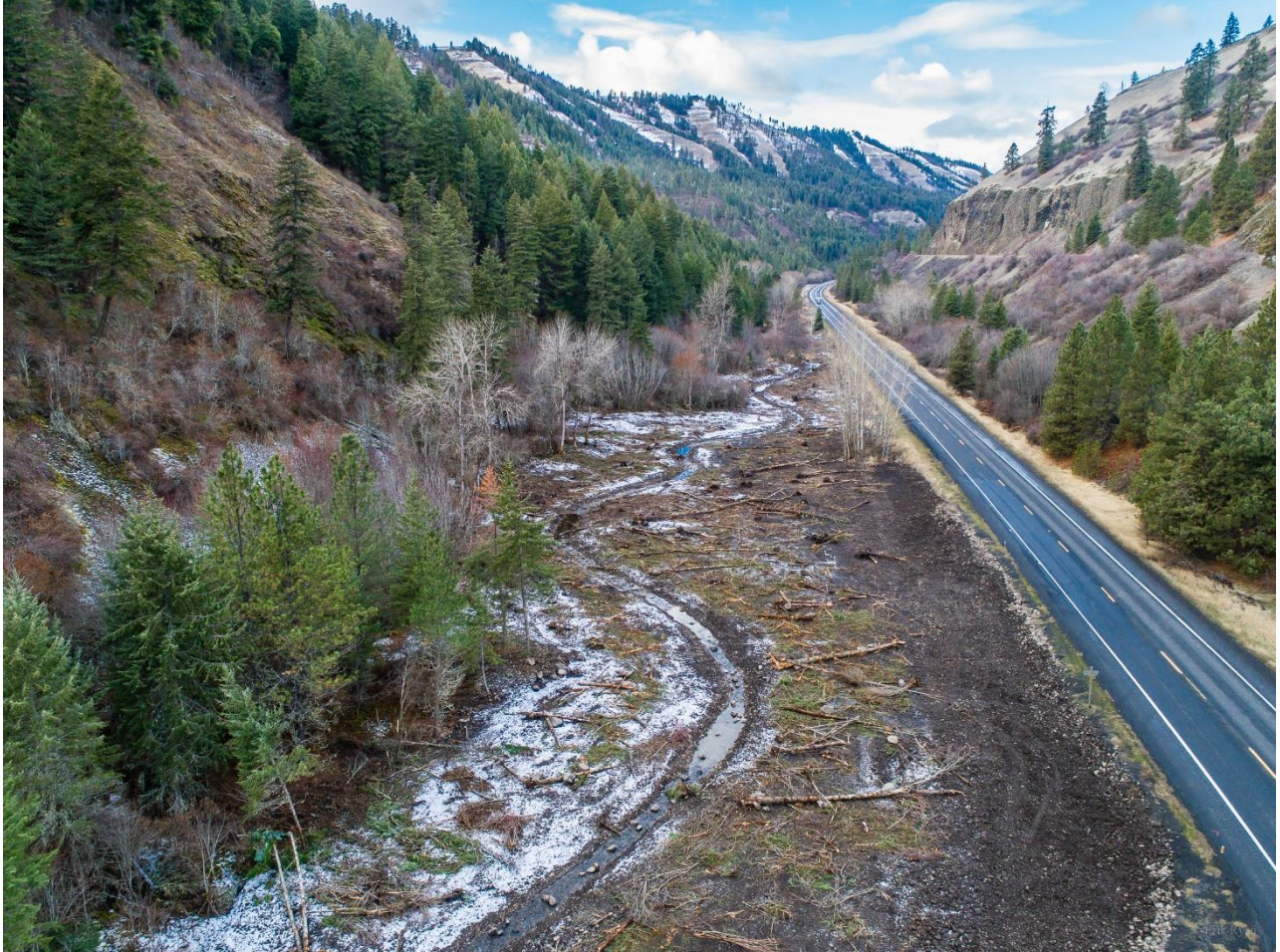
Photo 1. Overview of the proposed project area taken in December 2018 after the initial floodplain restoration project was completed.