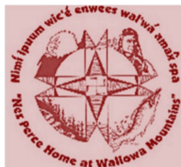
Center design is an ancient Nez Perce symbol called a whirlwind (Sa'plis). Other indigenous cultures use it as well. Its origin pre-dates any similar symbol related to European history of the 1900's.